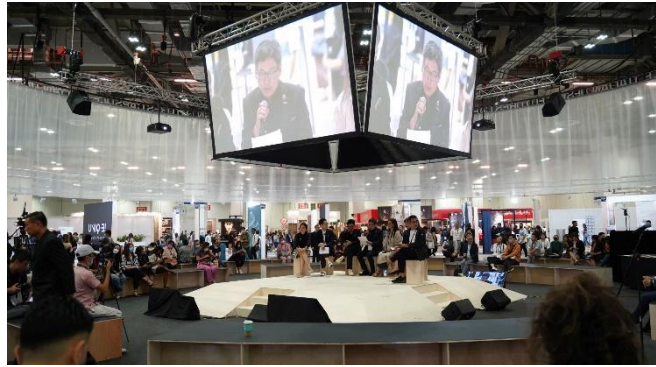
Global Summit 2022

able to take advantage of Continuing Professional Development (CPD) points that are offered for attending selected seminars.